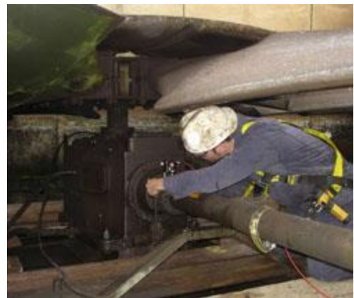
There is not much room under the large fan blades for the apprentice, but the other Laser/Detector is mounted on the Gearbox shaft.